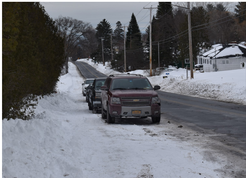
A snowy, bleak day in student parking