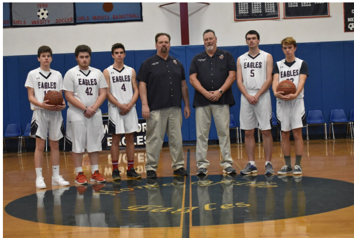
The Final Five members of Westport Eagles Boys Varsity Basketball

Vaping isn't a joke. If your friends are doing it, encourage them to stop. If you're doing it, just stop. It's not worth it. It will only do you and all the people around you harm. It really isn't worth getting suspended, getting addicted, and ruining your lungs all for a little buzz.